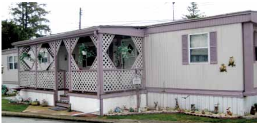
This manufactured home is part of an 82-unit community in New Castle, DE that became resident owned in July 2009.