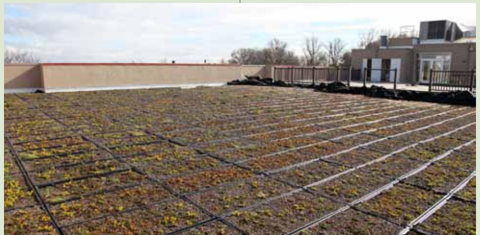
This green roof atop the Philadelphia Housing Authority's Warnock Village senior building is one of the energy-efficiency improvements made by the Philadelphia Housing Authority since the agency started working with a Drexel University research and advisory team.