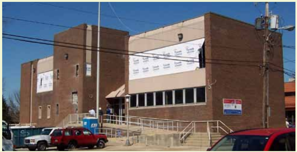
WSFS Bank in partnership with Barclays Bank Delaware in Wilmington provided construction financing for the conversion of a commercial building in downtown Wilmington into 16 efficiency apartments. The developer was Connections Community Support Programs, Inc. The Delaware State Housing Authority provided construction and permanent financing and an allocation of low-income housing tax credits.

Market condition constraints. Another set of constraints involves current market conditions. In the recent recession, uncertainty has grown about real estate valuations; as a result, banks have tightened loan-to-value (LTV) ratios. Regulatory agency oversight on credit policy has led to risk aversion, tightened credit standards, heightened pressure on return, and reluctance to delegate authority through participation. Small businesses are also struggling with low revenues, job contraction, and