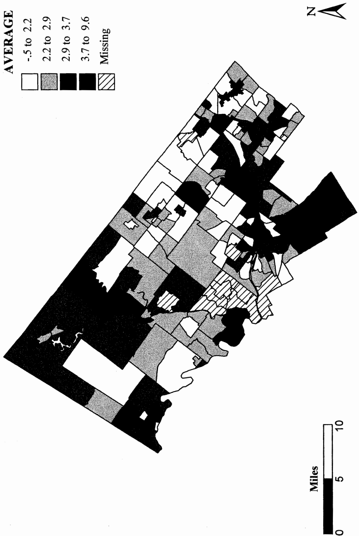
Figure 1 Average Appreciation by Census Tract