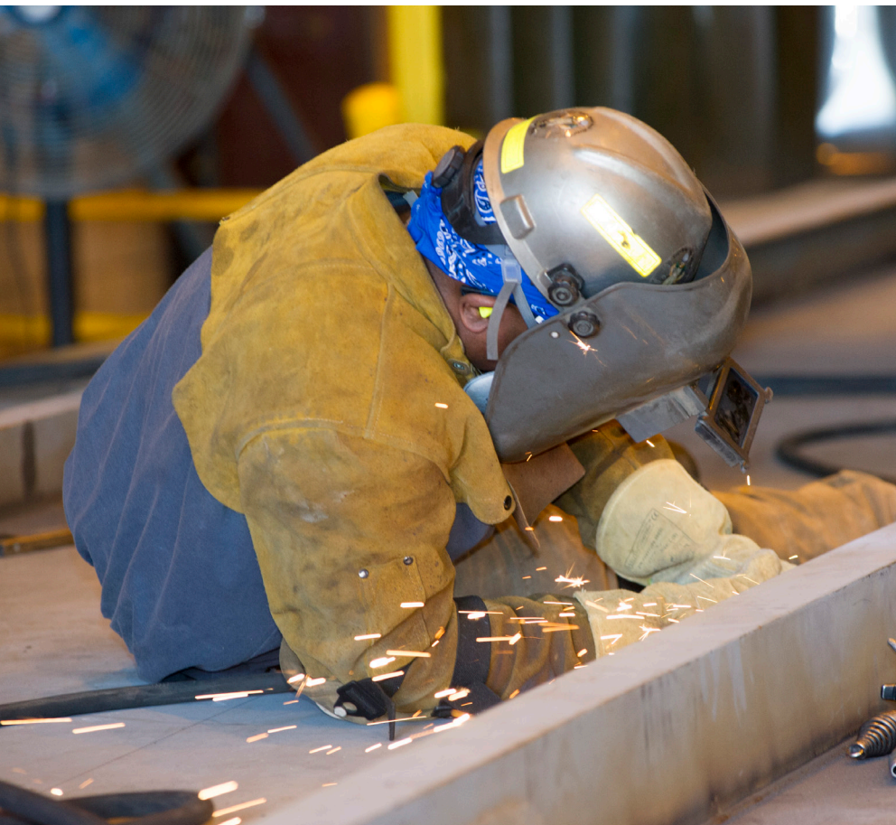
Shipbuilding worker in the apprenticeship program at Philadelphia Shipyard.