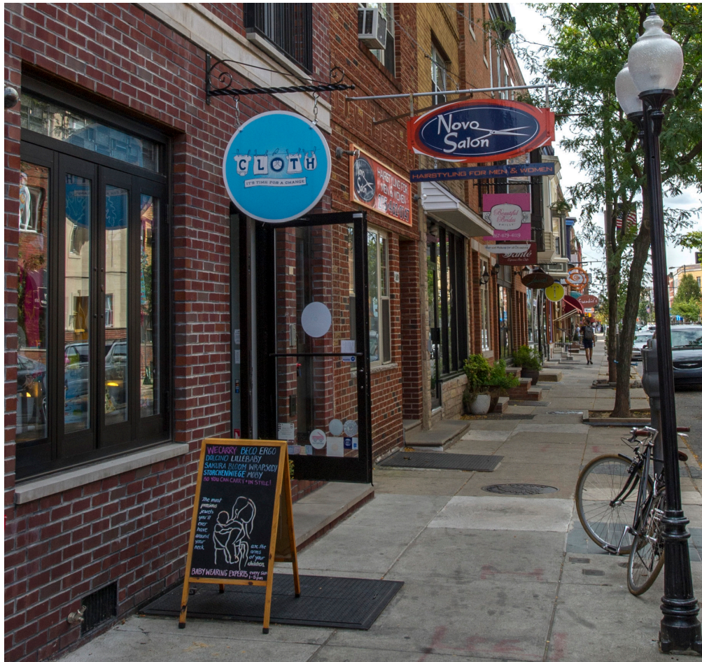
Small businesses line commercial corridor in South Philadelphia, PA.

A1. No. The concept of “community development” under 12 CFR __.12(g)(3) involves both a “size” test and a “purpose” test that clarify what economic development activities are considered under CRA. An institution’s loan, investment, or service meets the “size” test if it finances, either directly, or through an intermediary, businesses or farms that either meet the size eligibility standards of the Small Business Administration’s Development Company (SBDC) or Small Business Investment Company (SBIC) programs, or have gross annual revenues of $1 million or less. For consideration under the “size test,” the term financing is considered broadly and includes technical assistance that readies a business that meets the size eligibility standards to obtain financing. To meet the “purpose test,” the institution’s loan, investment, or service must promote economic development. These activities are considered to promote economic development if they support: