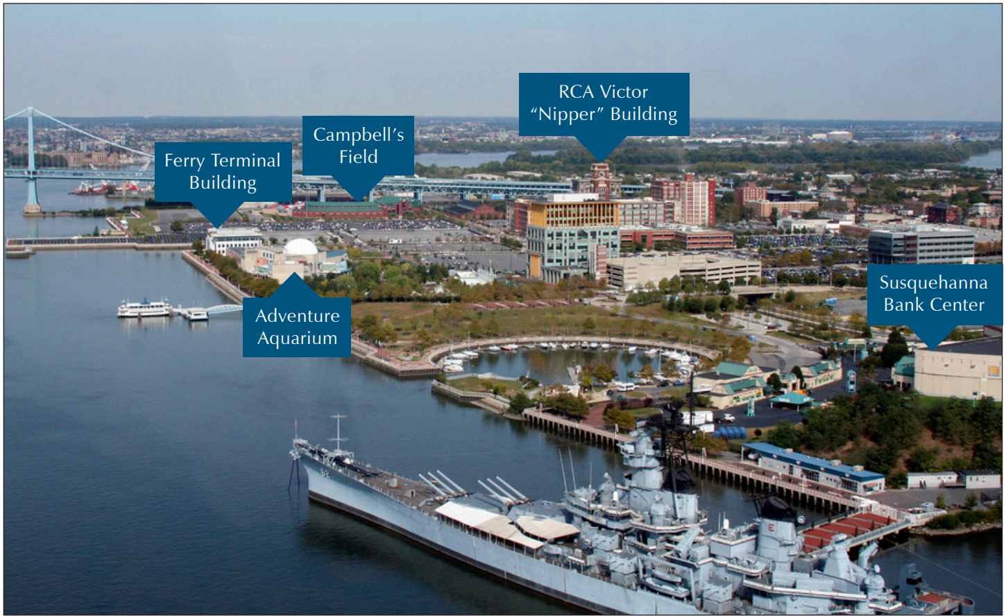
Key economic development projects on and near the waterfront in Camden, NJ. The Battleship New Jersey, which was decommissioned in 1991 and opened as an educational museum in 2001, is shown in the foreground.

apartments, the first new housing on the waterfront and the first market-rate housing in the city in 30 years.