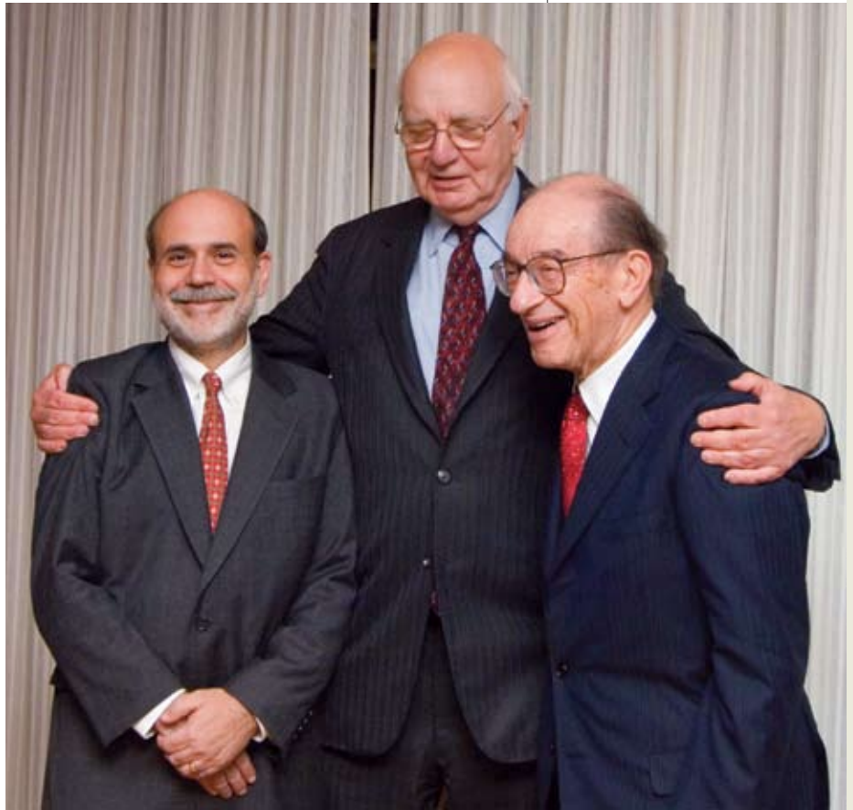
Federal Reserve Chairman Ben Bernanke, former Chairman Paul Volcker, and former Chairman Alan Greenspan at a reception in January 2006.

Barron's also opined on the transition, calling Volcker "a legend in his own time," and comparing him to Greenspan, who was "a relatively unknown quantity." Little did they know at the time, they were referring to the man who would come to be known as "the Maestro."