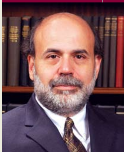
Chairman Ben Bernanke

As chair of Princeton's Economics Department, Bernanke described his managerial style as "primus inter pares" (first among equals). He has said, "We're all the same rank. I'm just the one sitting in the chair." This approach could also serve him well as Chairman of the FOMC, where all participants contribute to the outcome and policy action.