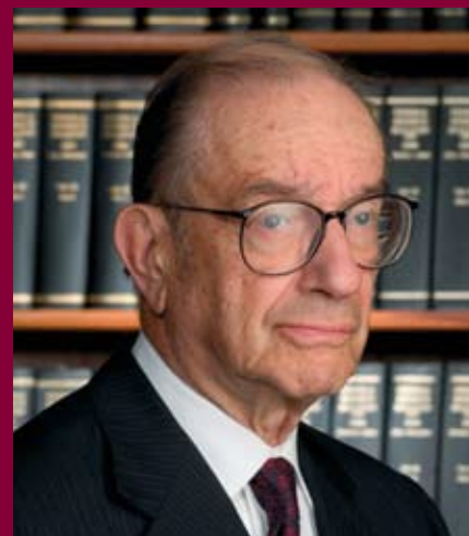
Former Chairman Alan Greenspan

Yet, historians will probably most remember Greenspan and the Greenspan era for the changes made to transparency in Fed policymaking over the past decade. This openness has been the defining aspect of monetary policy under Greenspan. Information about the Fed's policy goals, its assessment of the current economic situation, and its strategic direction are increasingly part of the public record.