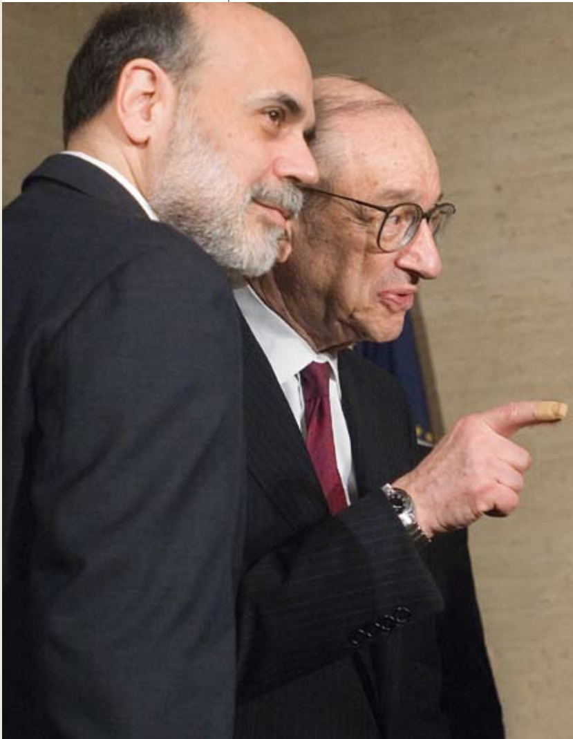
Chairman Bernanke and former Chairman Greenspan at the public swearing-in ceremony on February 6, 2006.

As the expansion of the 1980s matured, the Chairman remained true to his words. However, only two months after he took office, Greenspan was faced with the biggest stock market crash since the Great Depression. On October 19, 1987—Black Monday—the Dow Jones Industrial Average plummeted nearly 23 percent, its greatest loss ever in percentage terms. Amid widespread fears of a recession, Greenspan acted quickly to provide liquidity to financial markets and calm investors. His quick response