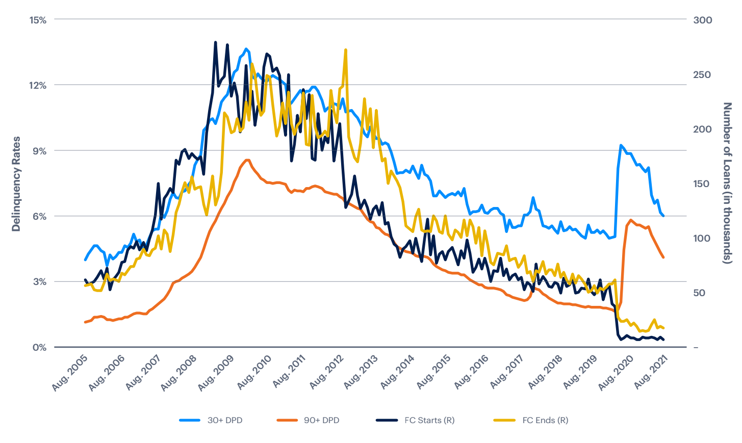
Figure 3: Delinquency Rates and Foreclosure Flows as of July 2021

(Delinquencies as percent of balances, foreclosures (FC) in thousands)