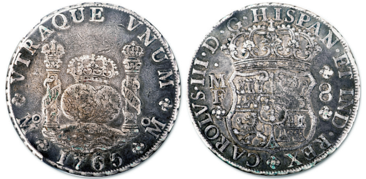
The Spanish milled dollar, minted from silver and worth eight reales, circulated more readily in North America than did British coins. After independence, Congress authorized the minting of U.S. dollar coins, equal to the value of the Spanish milled dollar.

then use to make interest payments to the depositors who withdraw their money next year. 5 The bank accepts deposits from many depositors, some of whom will withdraw their money next month and some of whom will withdraw their money next year. Typically, only depositors who need to pay for something on short notice will withdraw their money next month. However, if all the depositors lose confidence in their bank and withdraw their money next month, there won’t be enough money invested in the liquid assets to pay them all, and the otherwise stable bank may become bankrupt. This is called a bank run. 6 If many banks suffer a run at the same time, we say it is a banking crisis .