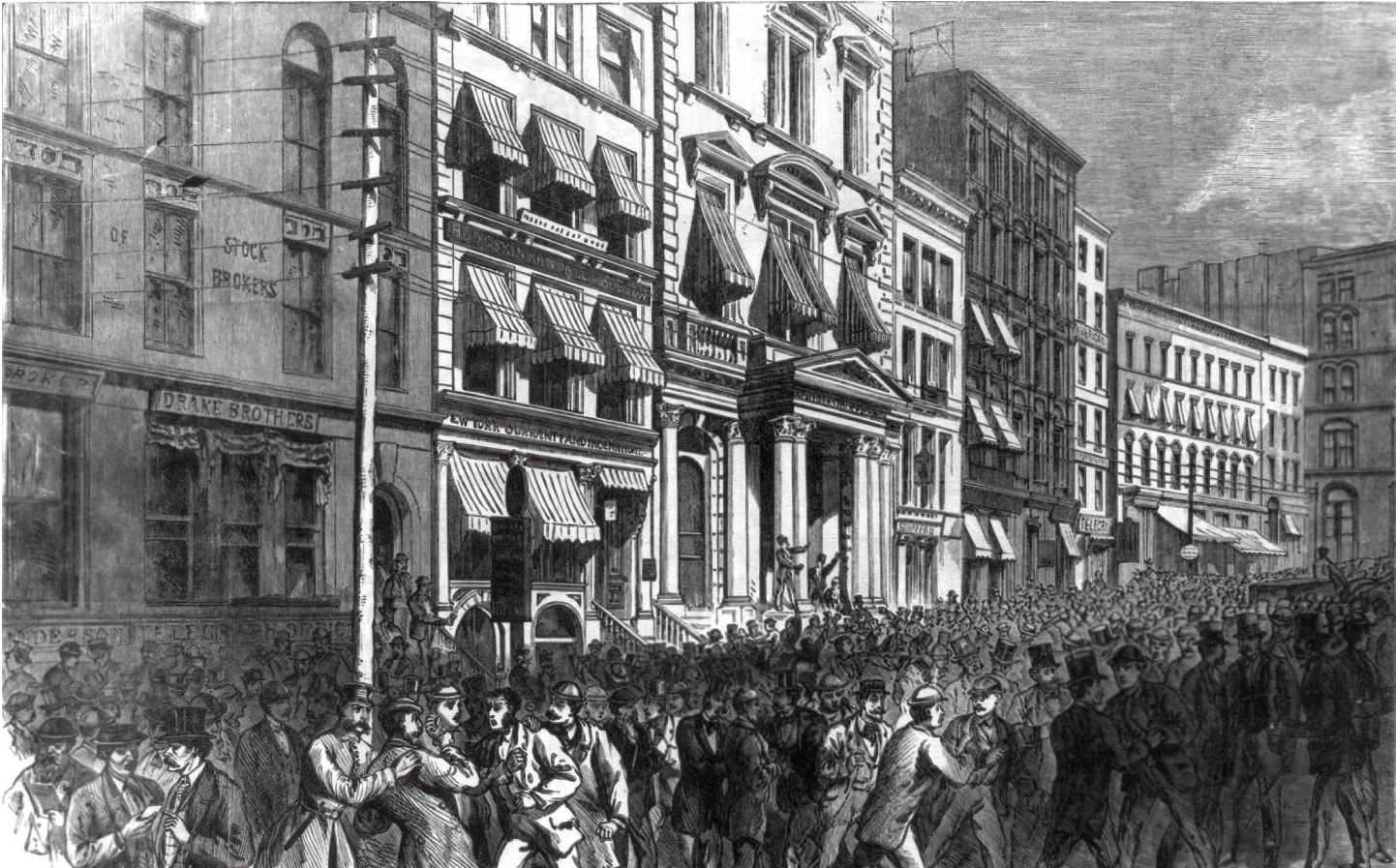
An illustration of the Panic of 1873 outside the old New York Stock Exchange building on Broad Street.

assets when they invest on their own. Diamond and Dybvig show that they can do better by depositing their money in a bank.