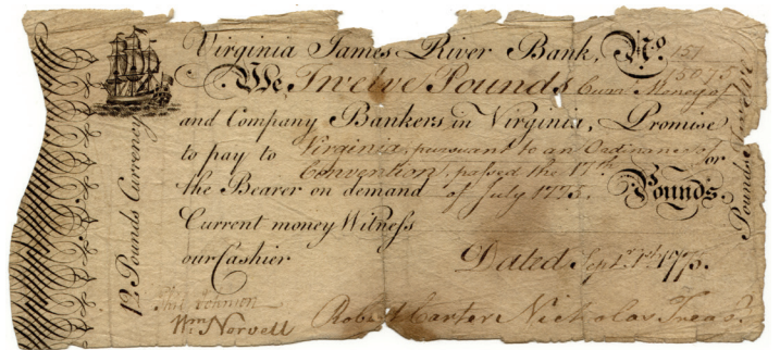
A colonial-era bank note from the James River Bank of Virginia for 12 pounds.