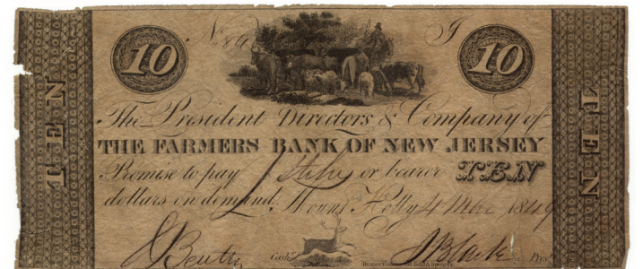
A mid-19th century bank note for $10.

See The Diamond-Dybvig Theory of Bank Fragility .