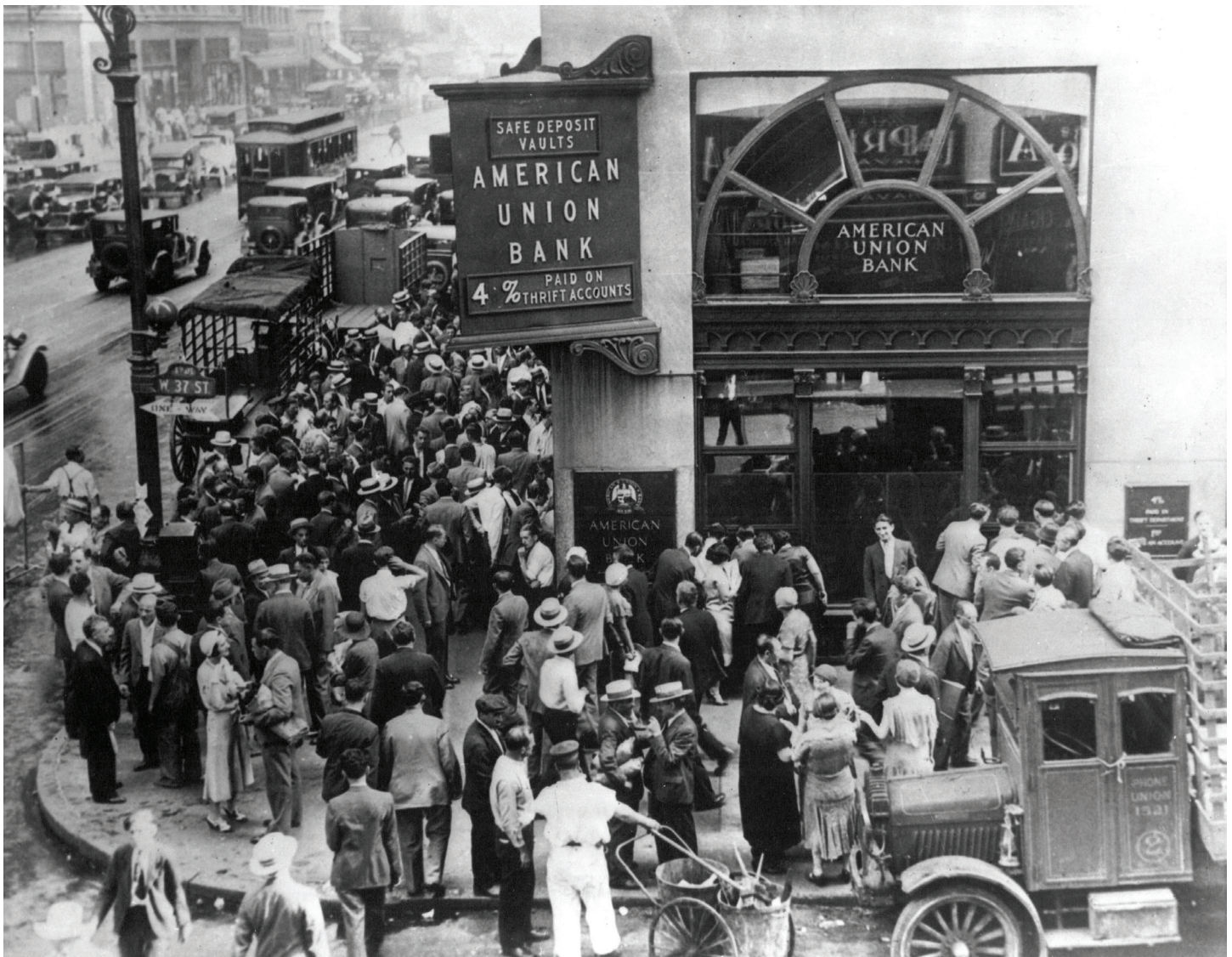
Depositors run on American Union Bank early in the Great Depression in the aftermath of the stock market crash in 1929.

This severe contraction of the money supply was a painful learning experience for the Federal Reserve. As Schwartz and Friedman pointed out, had the Federal Reserve issued outside money at short notice by purchasing the illiquid assets of the banking system (that is, by making widespread loans to struggling banks), it could have prevented the destruction of inside money associated with bank runs.